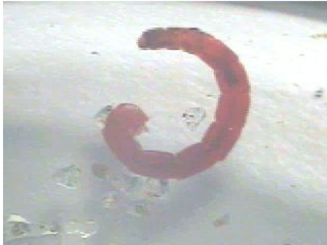
A Chironomid (or midge) from Lake Eustis

Eustis South received a Hulbert Index score of 5. The Hulbert Index is based on the number of pollution-intolerant lake macroinvertebrate species present. Therefore, higher Hulbert Index scores indicate a greater number of pollution sensitive species present or better water quality.