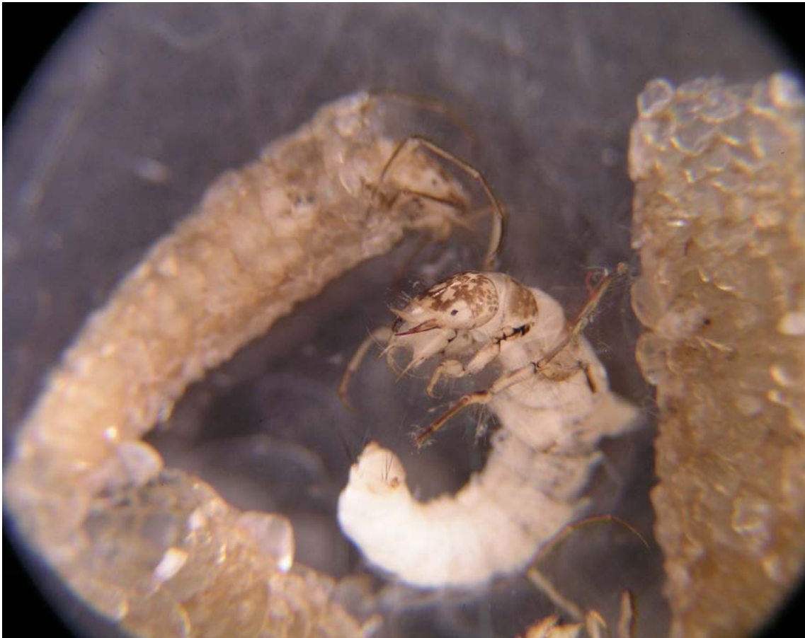
caddisfly Trichoptera Oecetis sp. C with case.

The Chironominae Polypedilum halterale group and Oligocheate tubificid worms were also the predominate taxa present in the south portion of Lake Louisa and each group comprised 30% of the total population of macroinvertebrates in the south portion of the lake. There were no pollution sensitive caddisfly species or Hexagenia mayfly species present in the south portion of the lake in 2009. The median LCI score improved from a good 38.53 in 2005 to a very good 55 in 2006 and an improved very good 60.66 in 2007. However, the score has dropped to 26.88 in 2009. The south portion of Lake Louisa appears to be especially sensitive to the amount of rainfall/ stormwater sources entering the lake. The first LCI performed in 2005, followed an extensive amount of rainfall (and three hurricanes in 2004). The heavier rainfall levels in 2004 were immediately followed by years of drought ending with the rainfall beginning in 2009. During the years of drought/ decreased stormwater inputs, the lake was able to recover somewhat in the south portion of Lake Louisa. However, the steady declining LCI scores in the north portion of the lake may indicate a trend of decline in the overall lake biota.